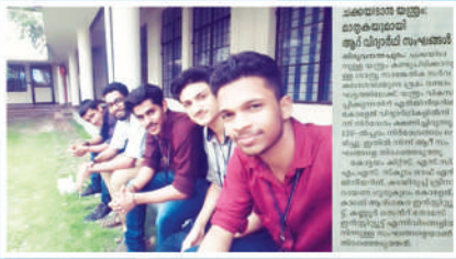
A Five member 3rd year team of STM getting into the final stage of KTU University Project Competition with their product 'Chakka Kokka', a Jackfruit Plucking contraption designed and manufactured exclusively by students. They were selected from among 120 colleges to be in the final round.