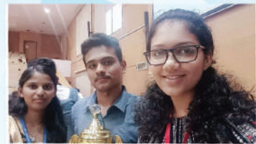
S4 CIVIL - 1st Prize For Design Competition @ IIT BOMBAY