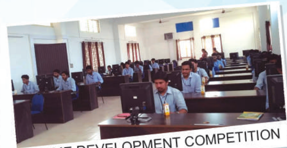
GAME DEVELOPMENT COMPETITION