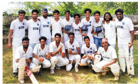
University Zonal Runners Up - STM