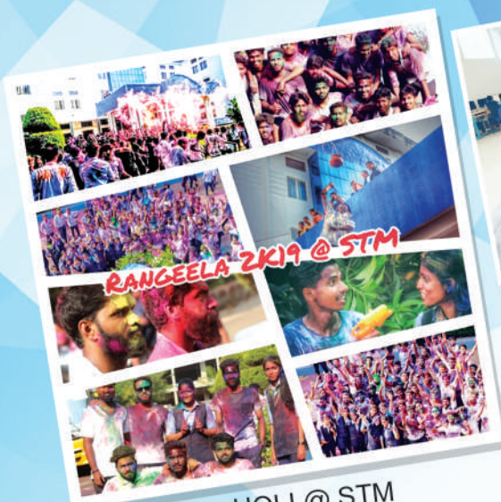
HOLI @ STM