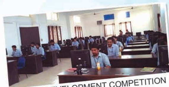
GAME DEVELOPMENT COMPETITION