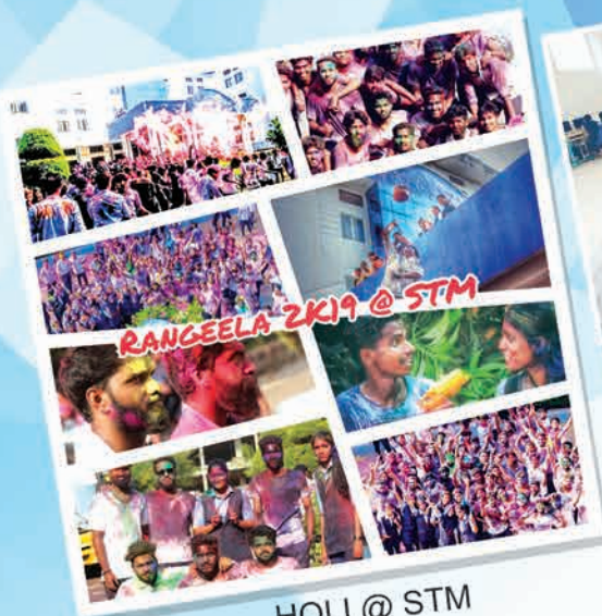
HOLI @ STM