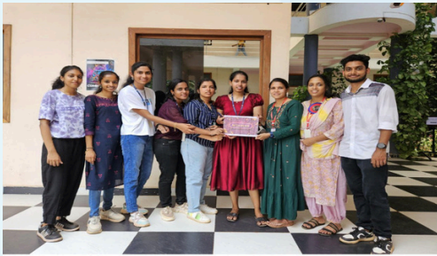
Hidden Gems( Treasure Hunt)