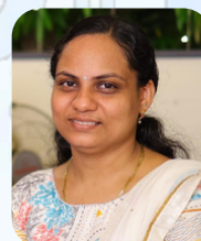
DINLA O K